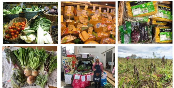
Production/ Marketing Sites of Organic Foods